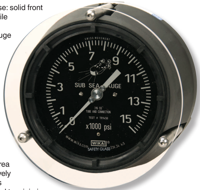
Model 233.34 SUB SEA with Lexan Shield shown with lower back mount