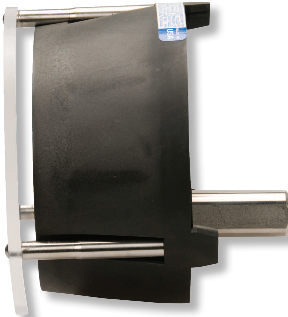
Side view of model 233.34 SUB SEA with Lexan Shield shown with lower back mount