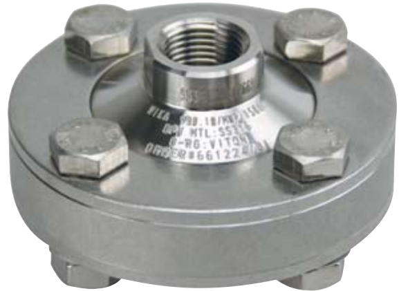
Standard Welded Diaphragm Seal Model L990.10

The diaphragm is welded to the upper housing which allows the replacement of the lower housing without jeopardizing the integrity of the system fill fluid and installed instrument. The upper and lower housing are bolted together and sealed by use of an O-ring. Process wetted components can be manufactured with solid metallic and nonmetallic materials.