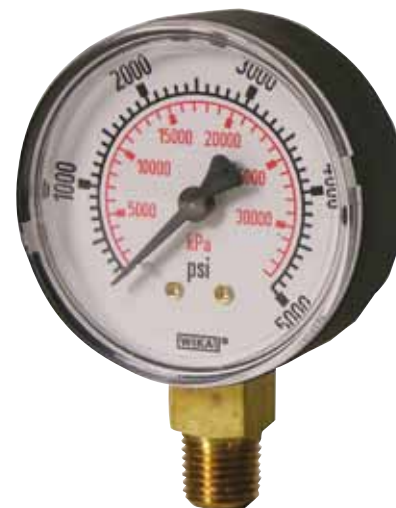
Bourdon Tube Pressure Gauge Type 111.10

Additional error when temperature changes from reference temperature of 68°F (20°C) ±0.4% of span for every 18°F (10°K) rising or falling.