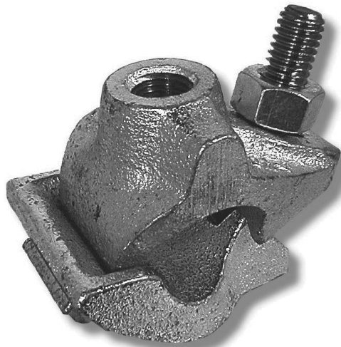
Model "ST" (With iron pipe thread)

The Skinner Saddle Tee is particularly recommended for installing garden gas lights, gas grills, automatic home laundries and other appliances. It takes the place of a tee, union and nipple in one fixture. No pipe cutting or threading is necessary. The cutting in of ordinary tees is sometimes extremely difficult. With the Skinner-Seal Saddle Tee, the job becomes fast and simple installation costs are substantially reduced.