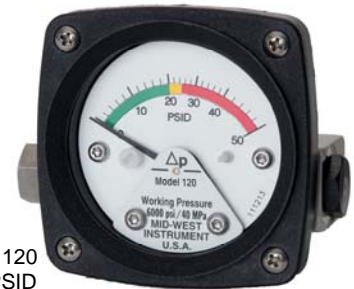
Model 120 0-50 PSID With Special 3 Color Dial

An optional maximum indication follower pointer provides automatic indication of maximum differential occurring during a time period or system cycle. Reversed pressure ports are optionally available to facilitate installation and readability depending on which side of a filter, etc., the instrument must be installed.