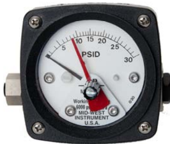
Model 120 0-30 PSID With Maximum Follower Pointer