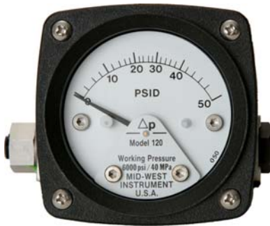
Model 120 0-50 PSID 2-1/2" Dial

A low cost differential pressure gauge for use in measuring the pressure drop across filters, strainers, separators, valves, pumps, chillers, etc., and for local flow indication and control.