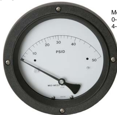
Model 120 0-50 PSID 4-1/2" Dial