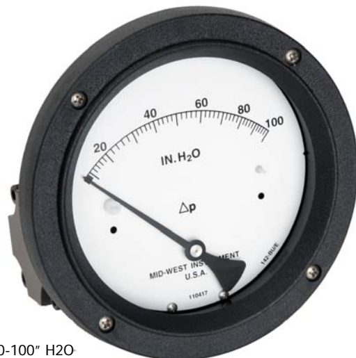
Model 142 0-100" H2O with 4-1/2" Dial